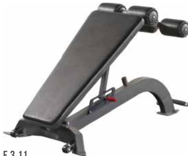
E 3.11 ABDOMINAL BENCH ADJUSTABLE