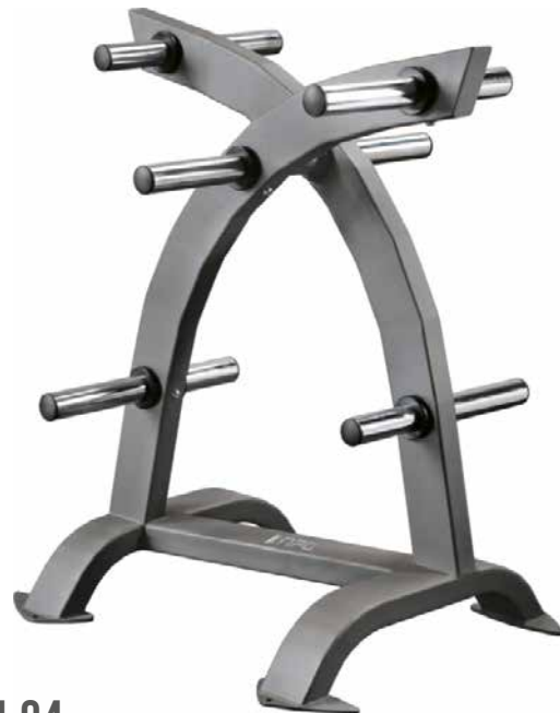
E 4.04 PLATE TREE (INNER DIAMETER 52MM)