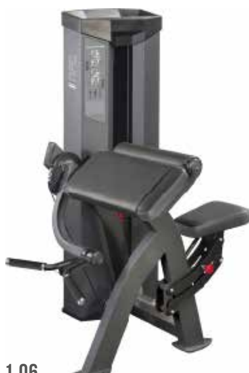
E 1.06 BICEPS MACHINE