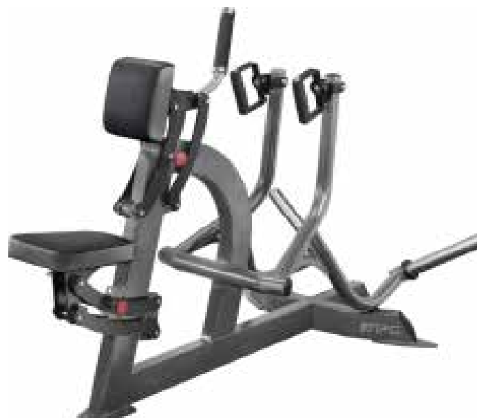
E 2.10 ROWING TRACTION