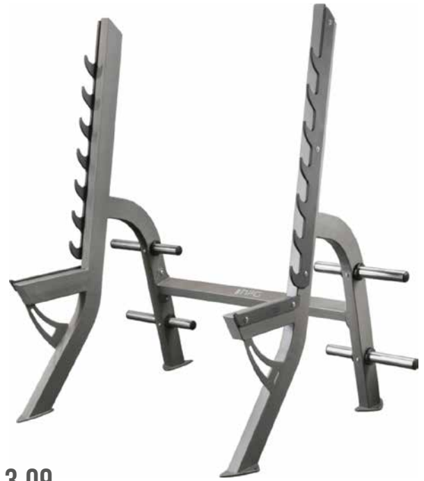
E 3.09 SQUAT RACK