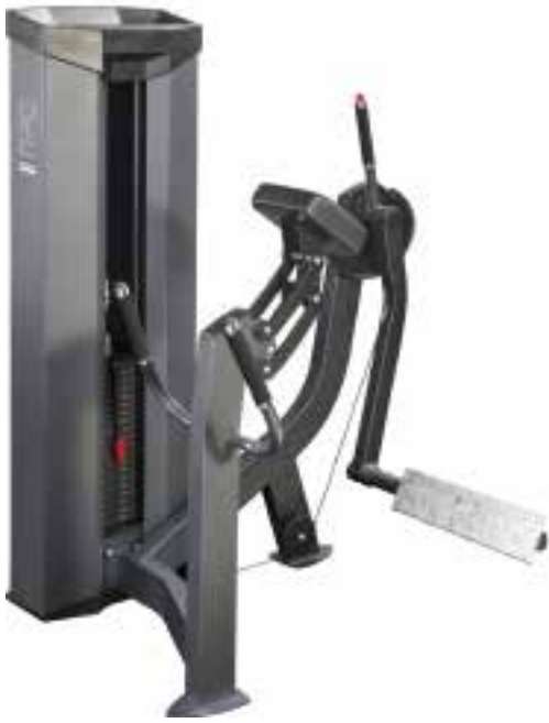
E 1.31 GLUTEUS MACHINE/RADIAL