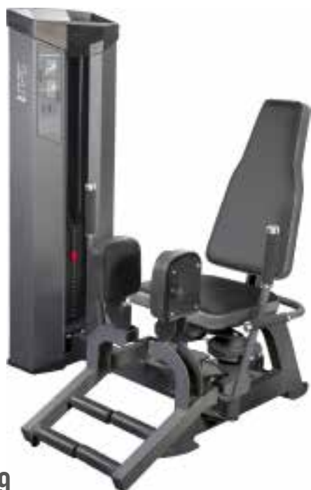
E 1.09 ADDUCTOR-ABDUCTOR MACHINE