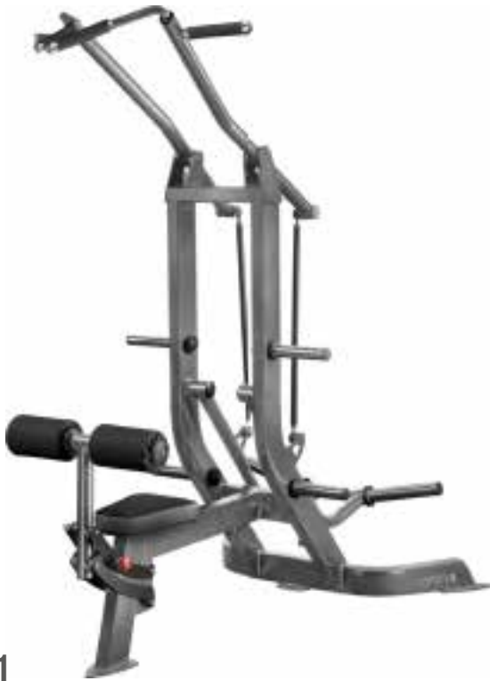
E 2.11 LAT PULL DOWN MACHINE