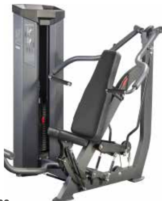
E 1.28 INCLINE PRESS