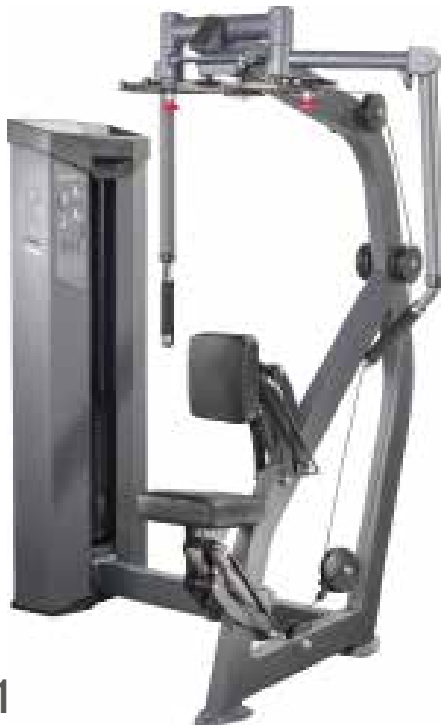
E 1.24-1 REAR DELTOID/PECTORAL FLY (WEIGHT-150KG)