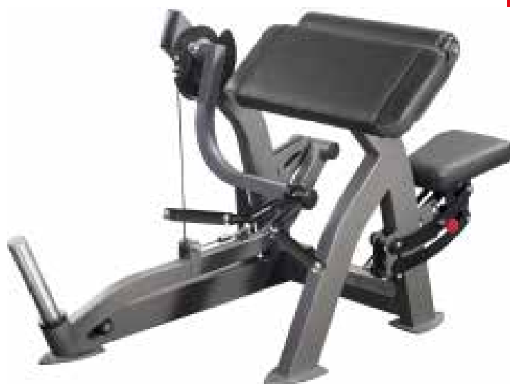
E 2.08 BICEPS MACHINE