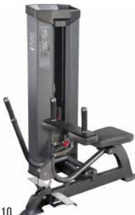
E 1.10 SEATED CALF MACHINE