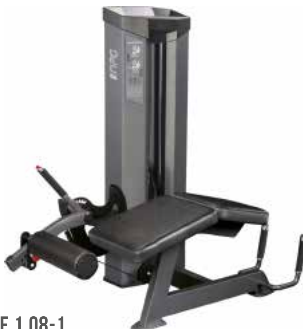
E 1.08-1 LEG CURL (PRONE POSITION)