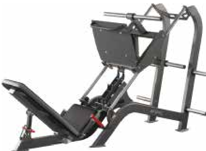
E 2.02 ANGLED LEG PRESS 45°