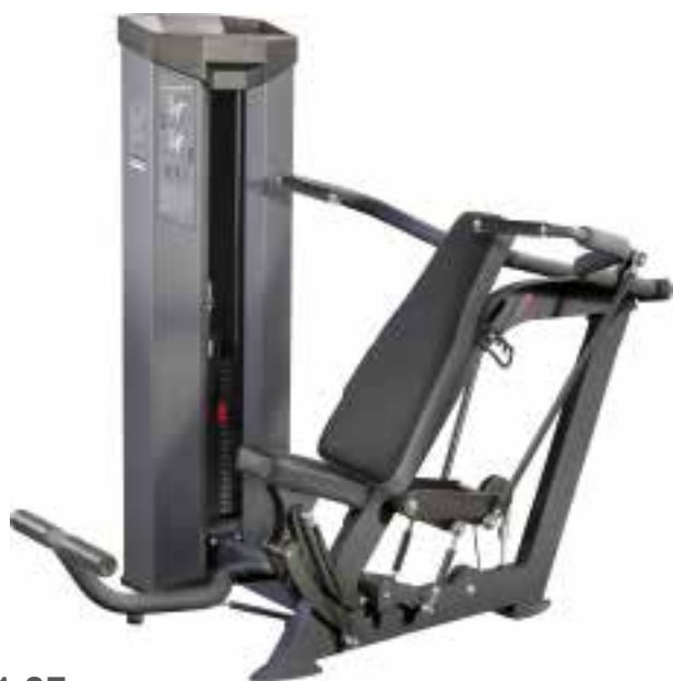
E 1.27 VERTICAL PRESS