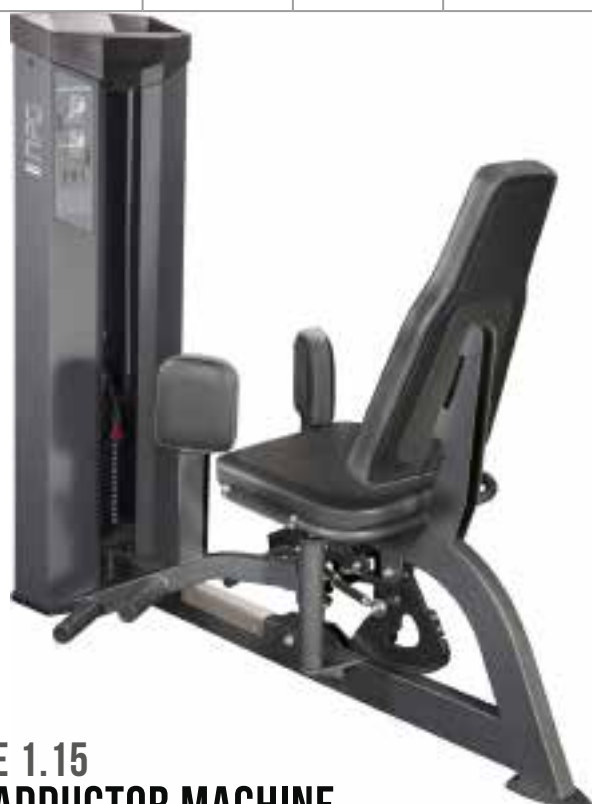
E 1.15 ADDUCTOR MACHINE