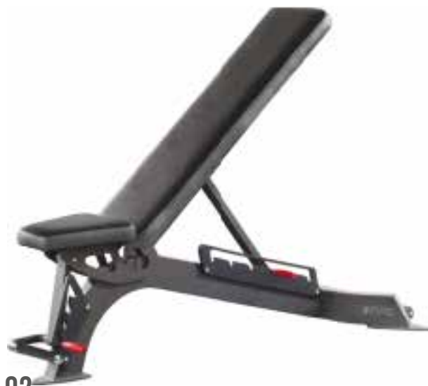
E 3.02 ADJUSTABLE BENCH