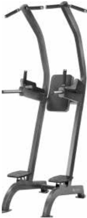
E 3.12 PULL-UP/DIP/ABDOMINAL COMBO