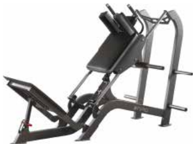
E 2.03 HACK SQUAT