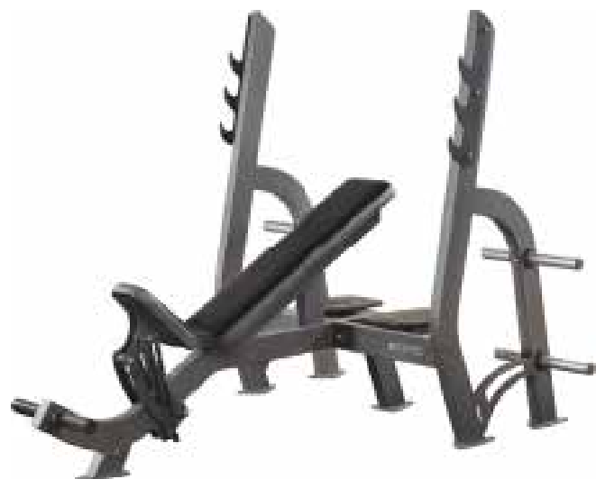
E 3.05 INCLINE BENCH