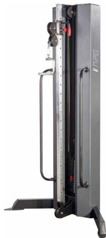
E 1.30 CROSS OVER CABLE MACHINE (SINGLE)