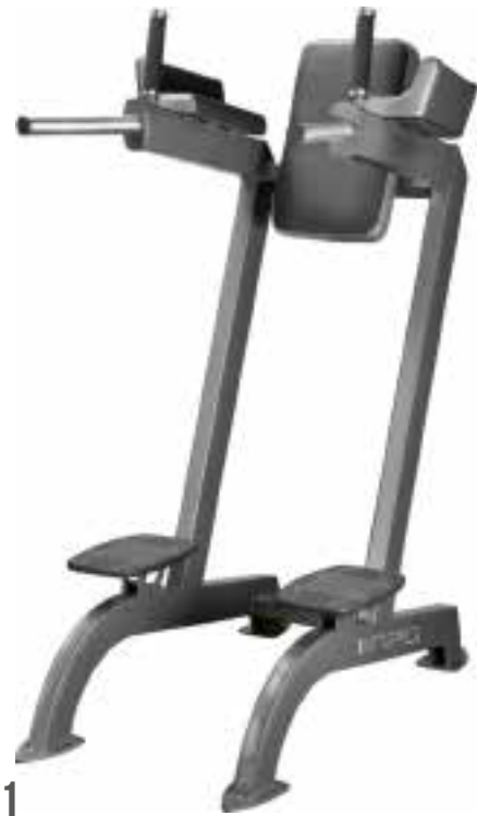
E 3.12-1 DIP/ABDOMINAL COMBO