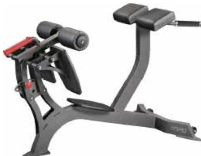
E 3.19 HYPEREXTENSION HORIZONTAL