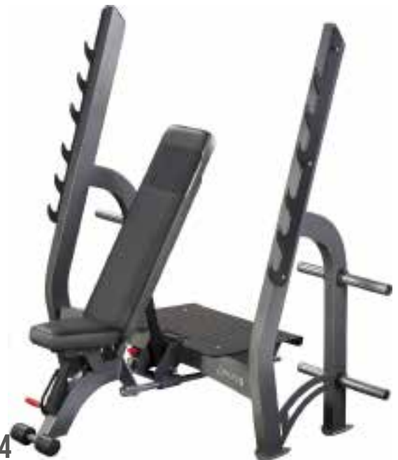
E 3.14 UNIVERSAL BENCH