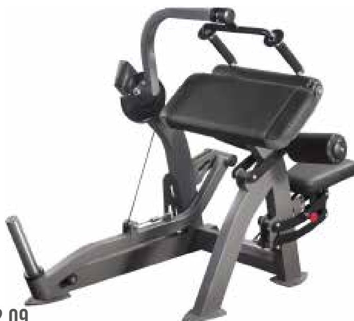
E 2.09 TRICEPS MACHINE