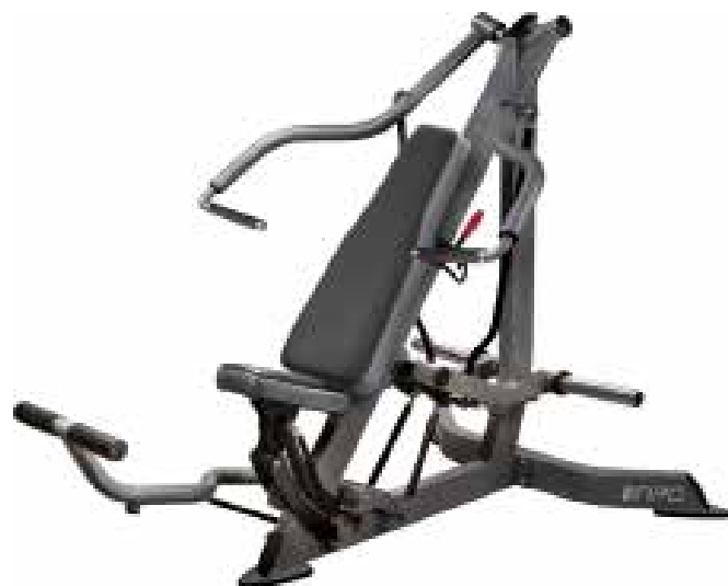
E 2.06 INCLINE PRESS