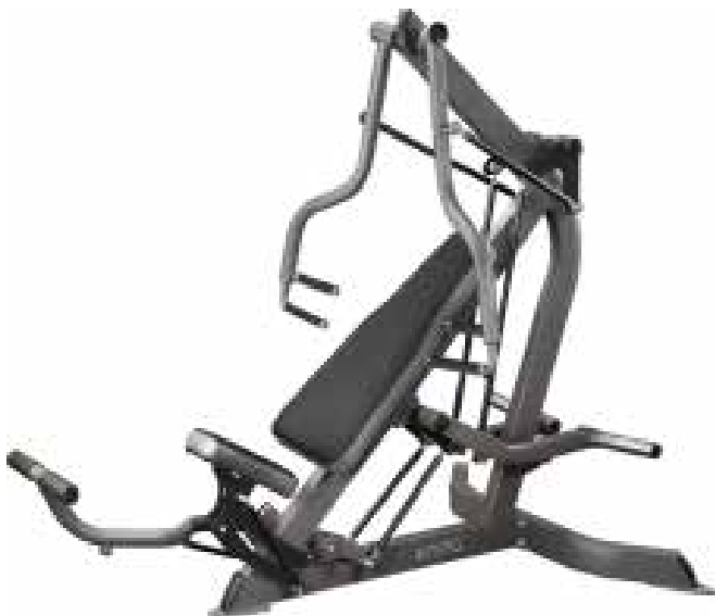
E 2.21 DECLINE PRESS