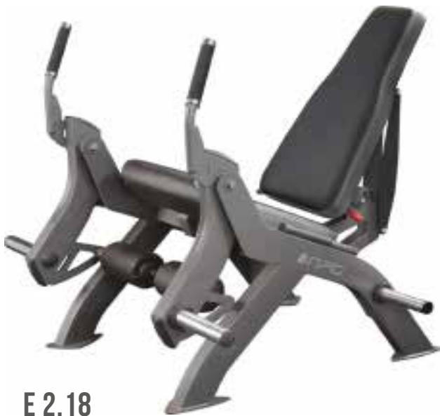
E 2.18 LEG EXTENSION