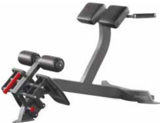
E 3.13 HYPEREXTENSION