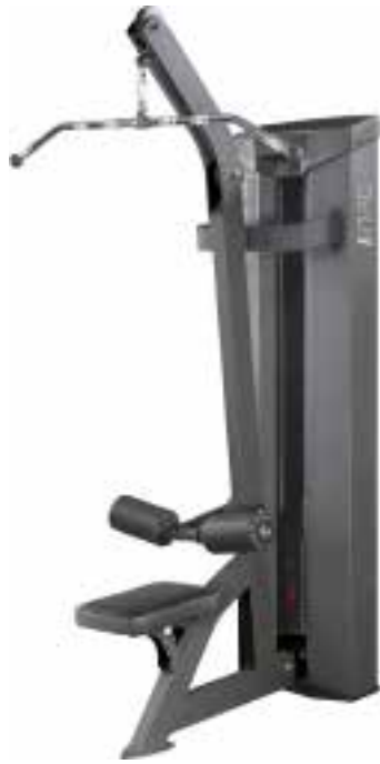
E 1.01 LAT PULL DOWN