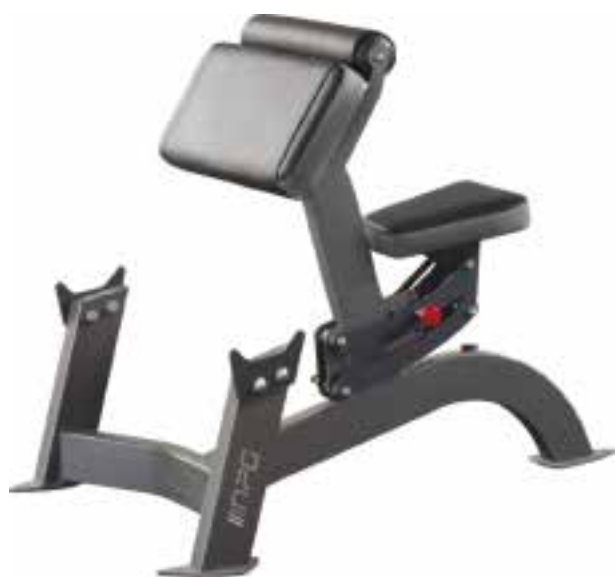
E 3.03 SCOTT BENCH