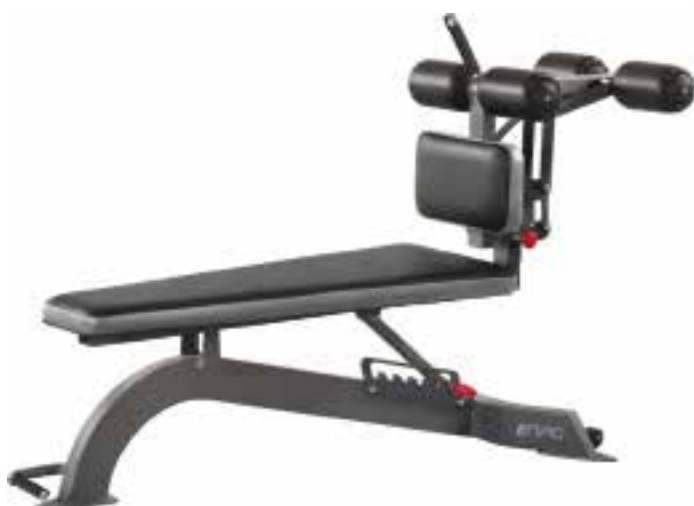
E 3.21 CRUNCH BENCH ADJUSTABLE