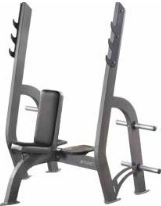
E 3.07 SHOULDER BENCH