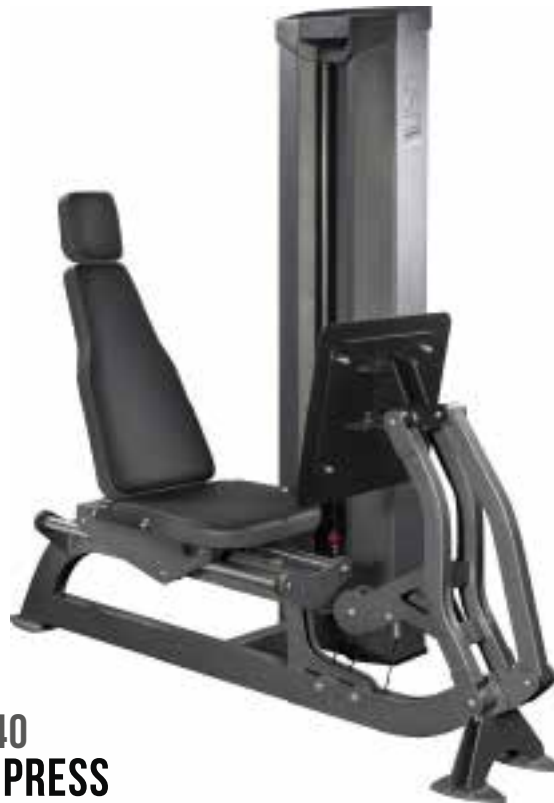
E 1.40 LEG PRESS