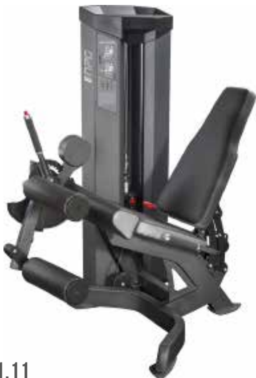
E 1.11 LEG CURL/EXTENSION COMBO