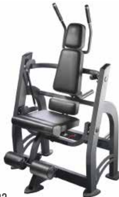
E 2.23 ABDOMINAL MACHINE