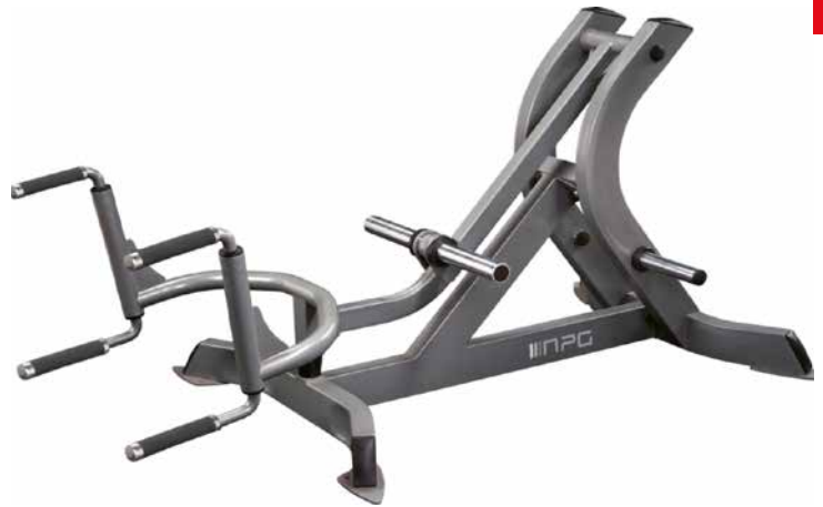
E 2.20 TRAPEZIUS ROW