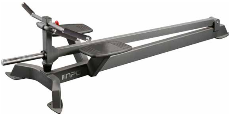
E 2.15 LEVER ROW WITH LEG STRESS