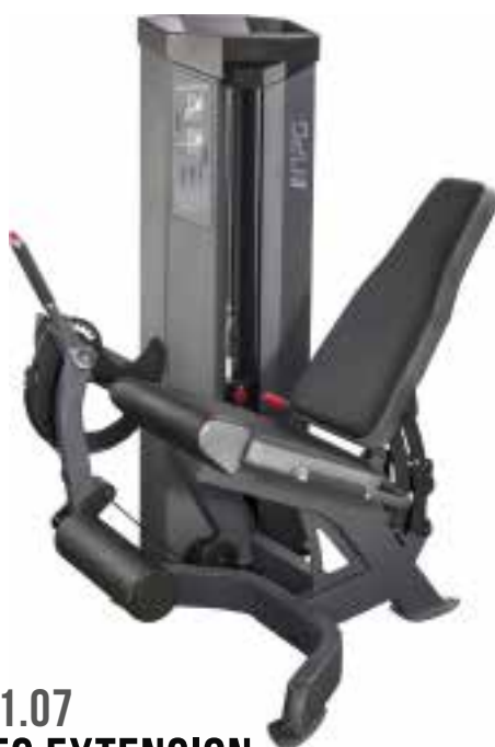
E 1.07 LEG EXTENSION