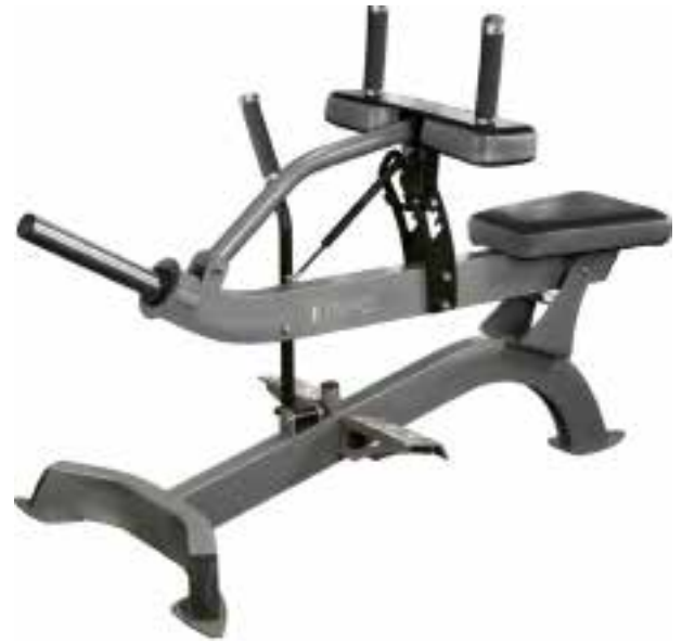
E 2.13 SEATED CALF