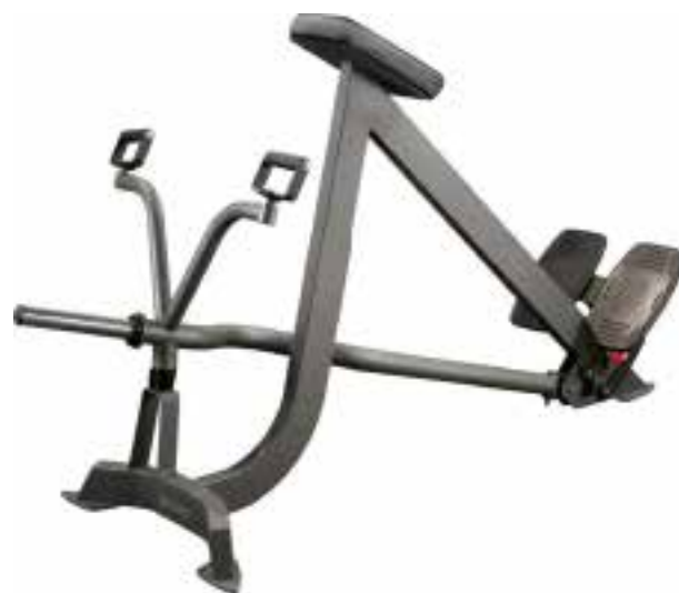
E 2.04 ROWING