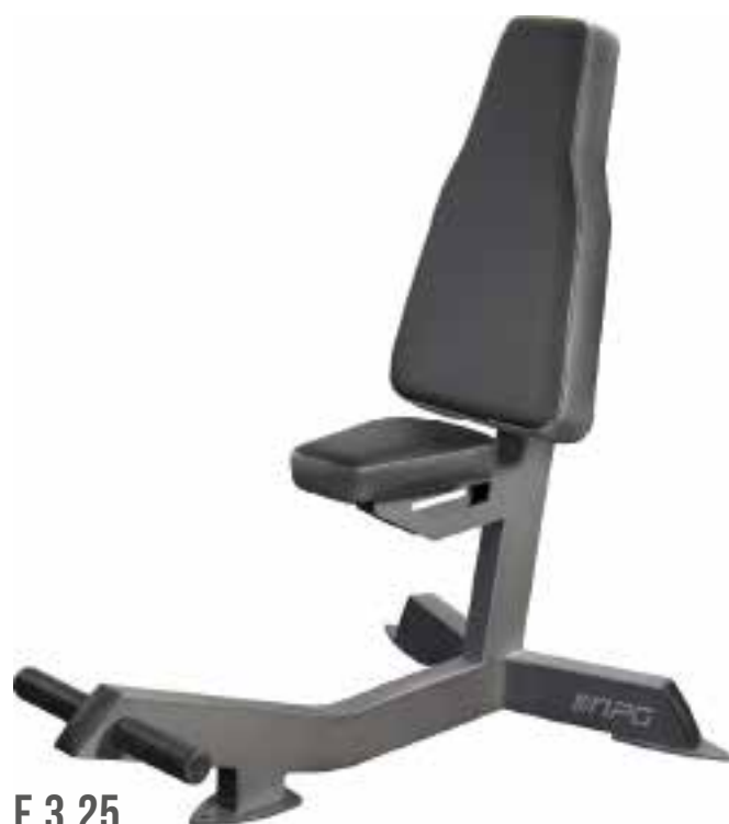
E 3.25 SHOULDER BENCH WITHOUT RACK