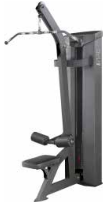
E 1.01-1 LAT PULL DOWN (WEIGHTSTACK-150KG)