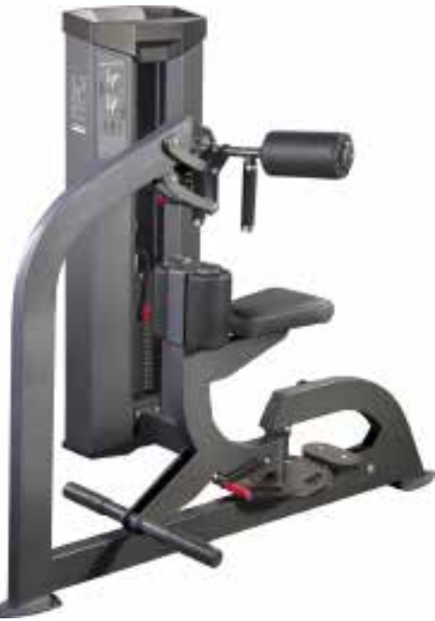
E 1.17 TWIST MACHINE