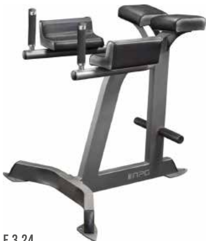
E 3.24 REVERSE HYPEREXTENSION