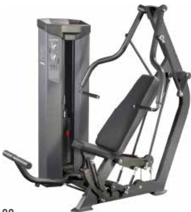
E 1.29 SUPINE PRESS