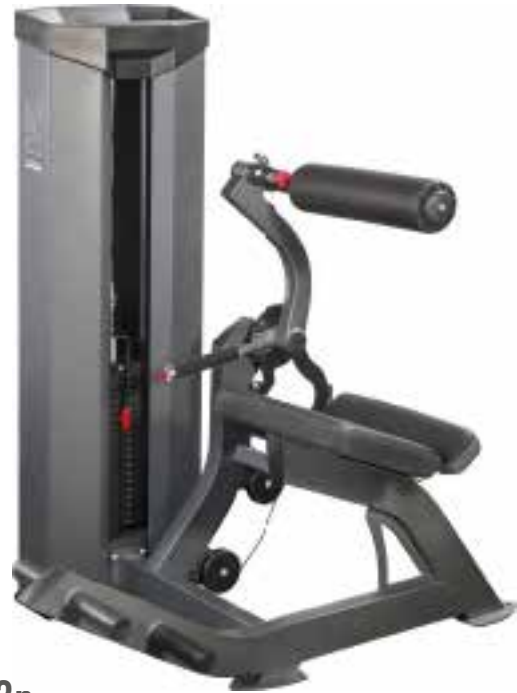
E 1.35 BACK EXTENSION