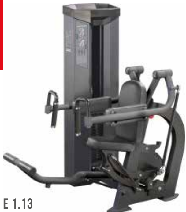
E 1.13 DELTOID MACHINE