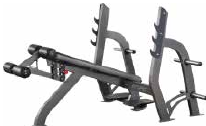
E 3.06 DECLINE BENCH