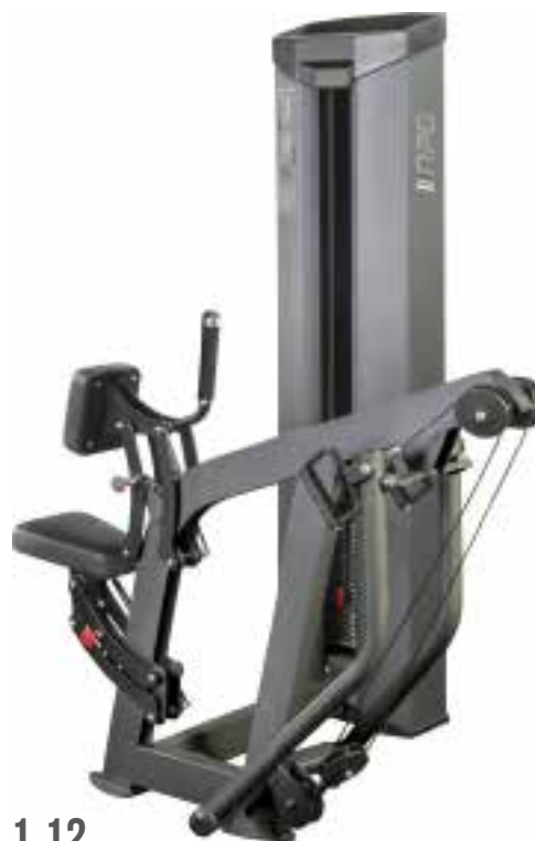
E 1.12 ROWING MACHINE