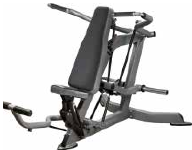
E 2.05 SHOULDER PRESS