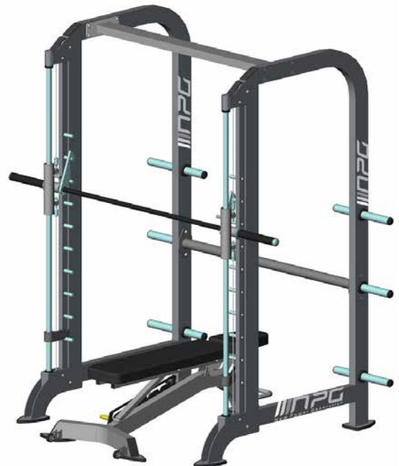
E 2.17-1 SMITH MACHINE WITH COUNTERWEIGHT (REINFORCED)