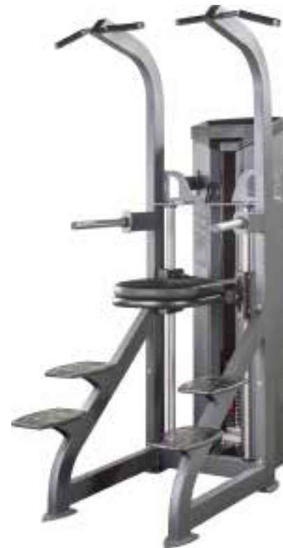
E 1.25 ASSISTED CHIN/DIP