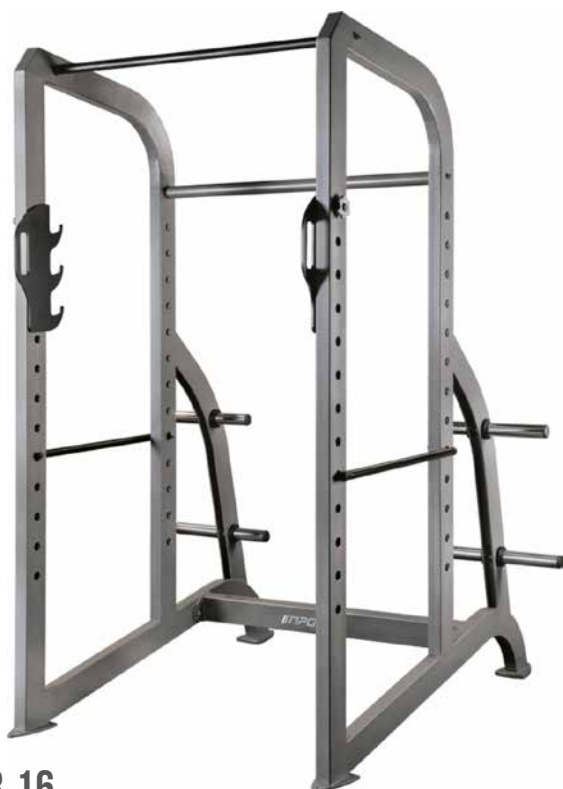
E 3.16 SQUAT FRAME