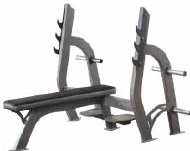
E 3.04 HORIZONTAL BENCH