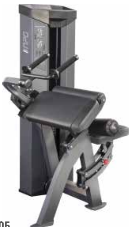
E 1.05 TRICEPS MACHINE