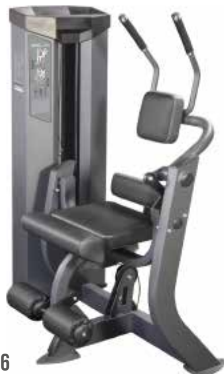
E 1.16 ANATOMIC ABDOMINAL MACHINE