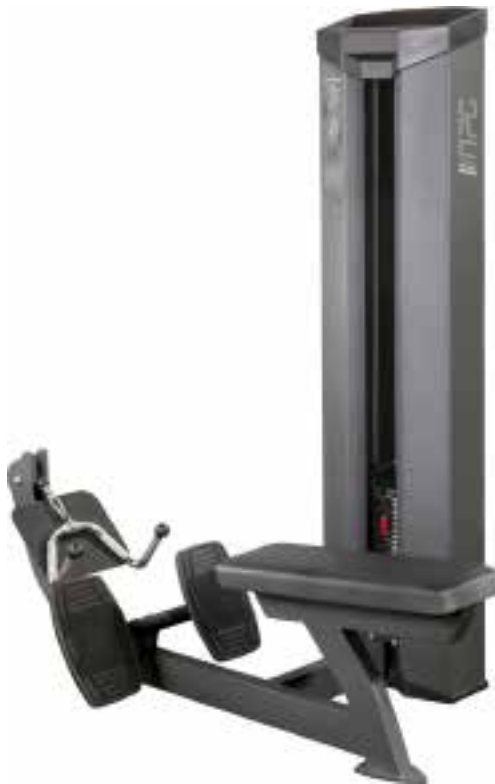
E 1.02 LOW ROW