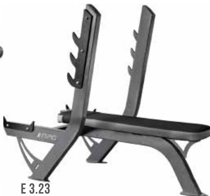
E 3.23 FRENCH BENCH