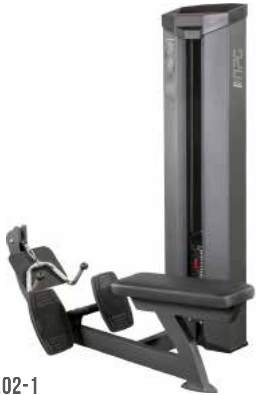
E 1.02-1 LOW ROW (WEIGHTSTACK-150KG)