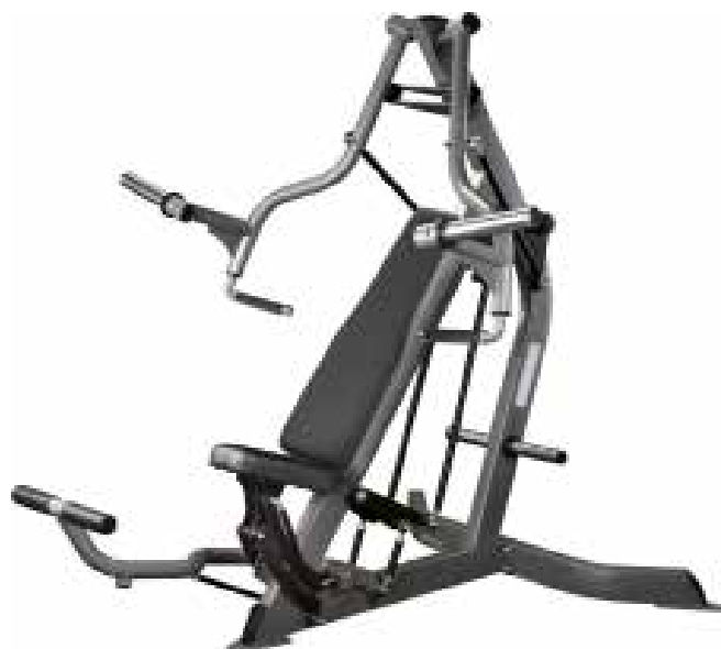
E 2.07 SUPINE PRESS