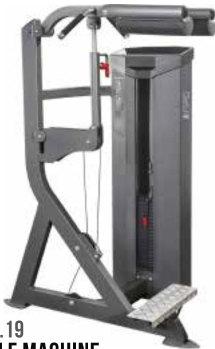
E 1.19 CALF MACHINE