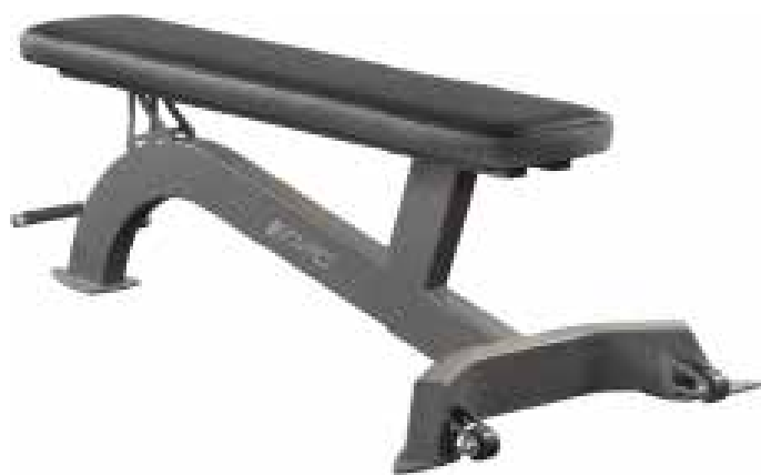
E 3.01 FLAT BENCH