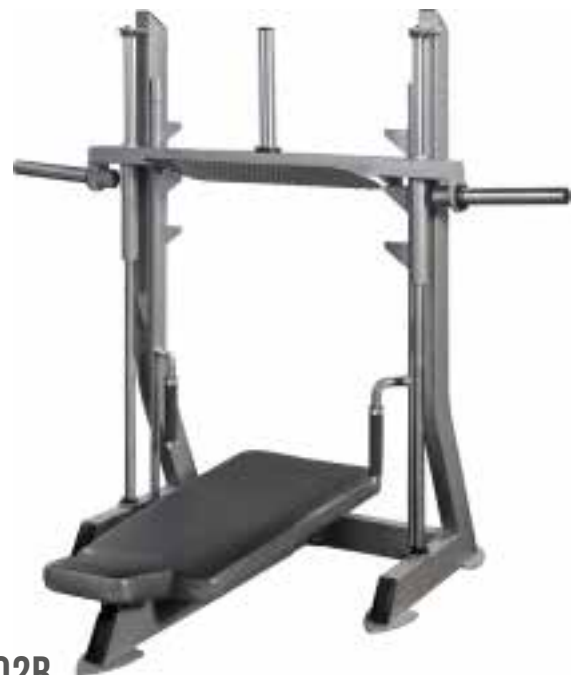
E 2.02B VERTICAL LEG PRESS