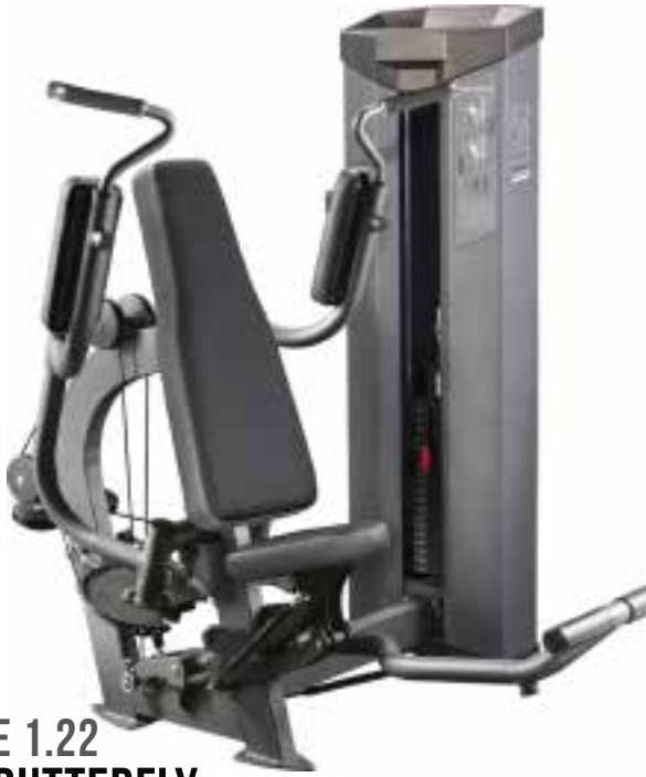
E 1.22 BUTTERFLY