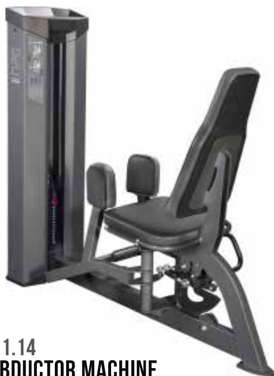
E 1.14 ABDUCTOR MACHINE