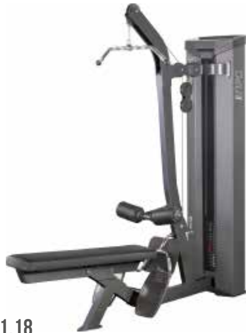
E 1.18 LAT-ROW MACHINE