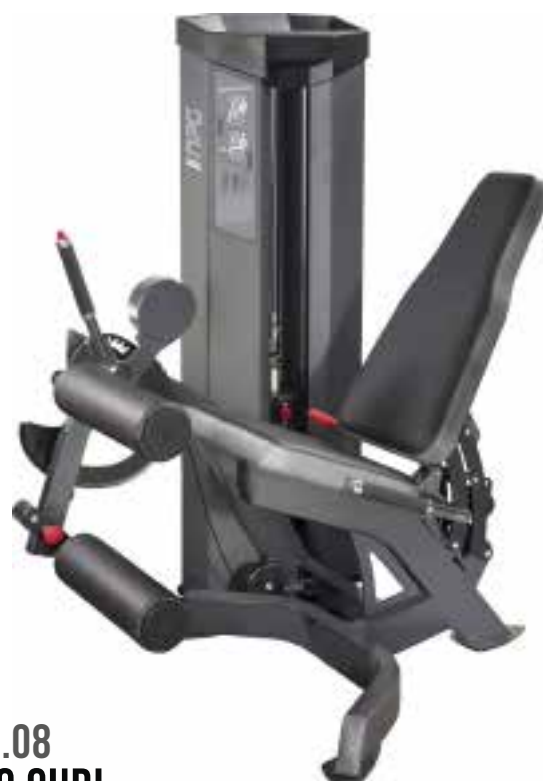
E 1.08 LEG CURL