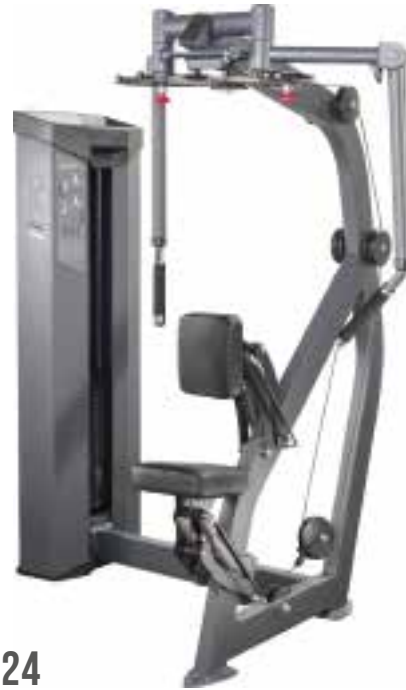
E 1.24 REAR DELTOID/PECTORAL FLY