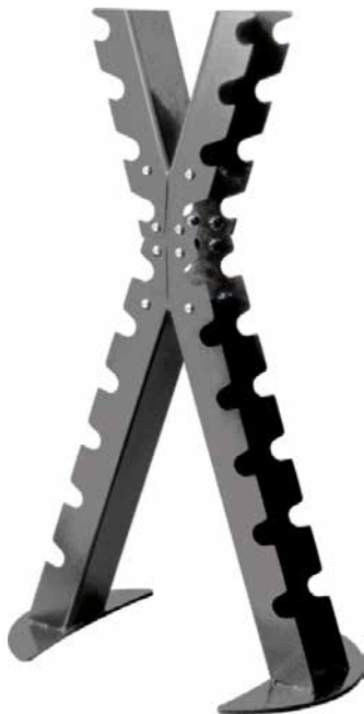
E 4.03 DUMBBELL RACK (0,5-10KG)